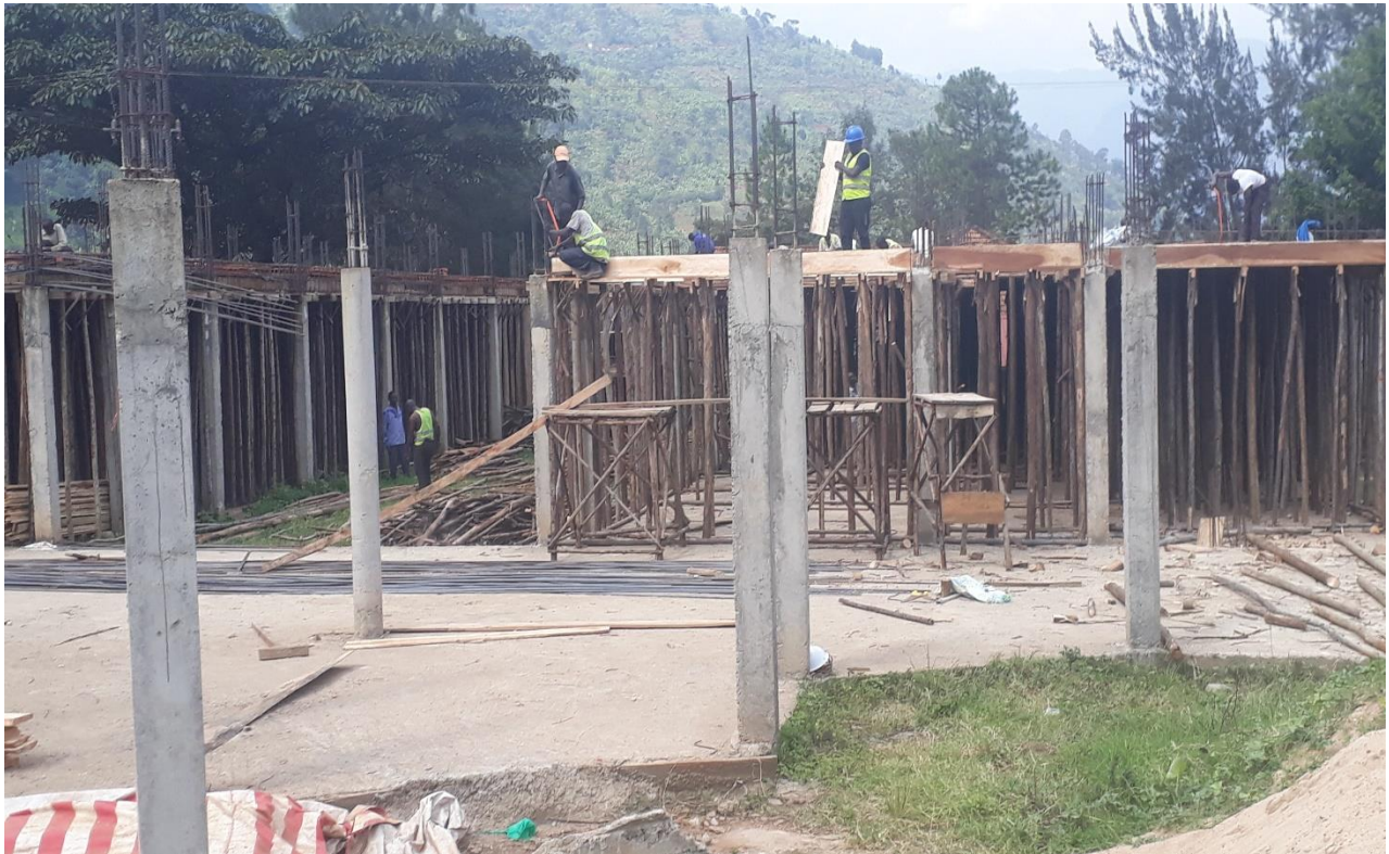
Figure 1: Construction of Administration Block Phase 3 ongoing

PRESENTED BY KAMOTI MILTON APOLLO WASUNGUYI